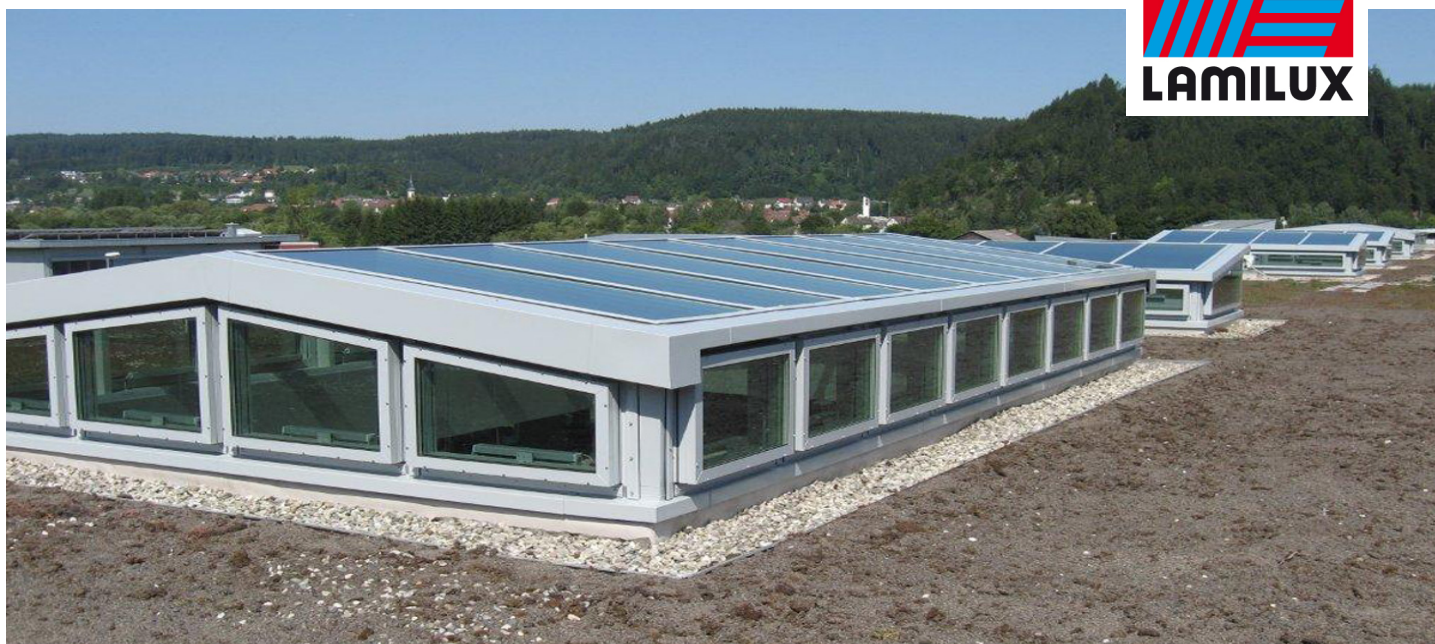
Projekt - budynek adminstracyjny w Tuttlingen