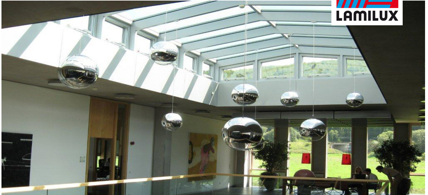
Projekt - budynek administracyjny w Tuttlingen