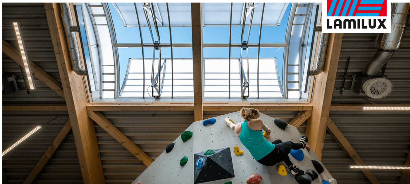
Projekt - centrum wspinaczkowe Owl